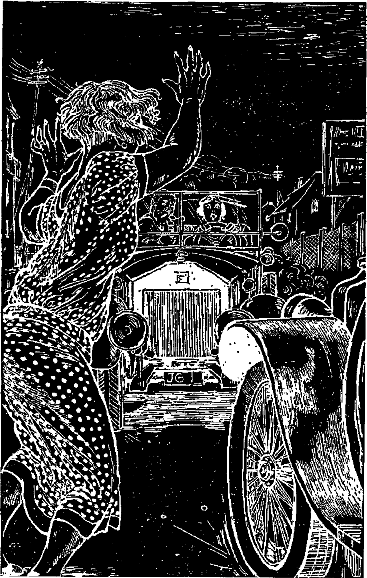
'That woman rushed into the road just as a car was coming the other way.'