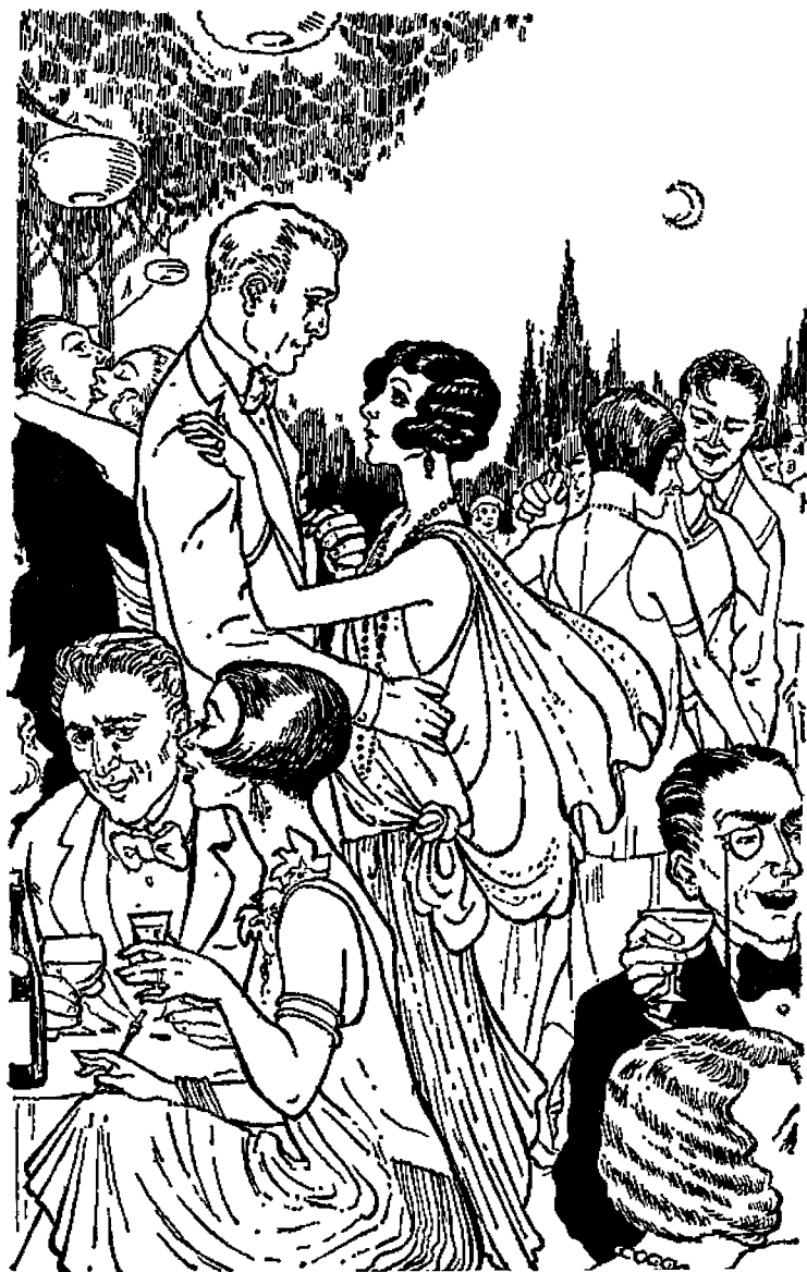
Daisy and Gatsby danced together.