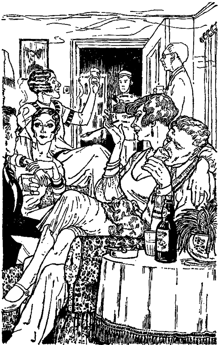
The room was filled with Myrtle's loud, false laughter.