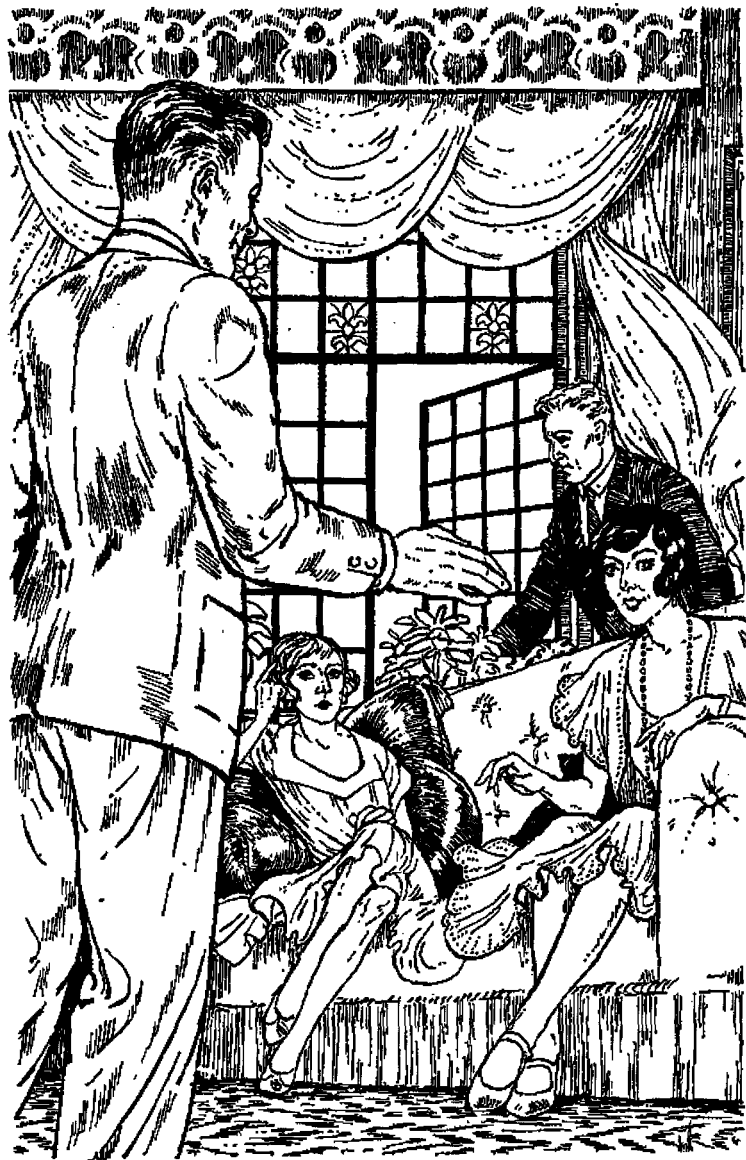
Two young women were sitting on an enormous couch.